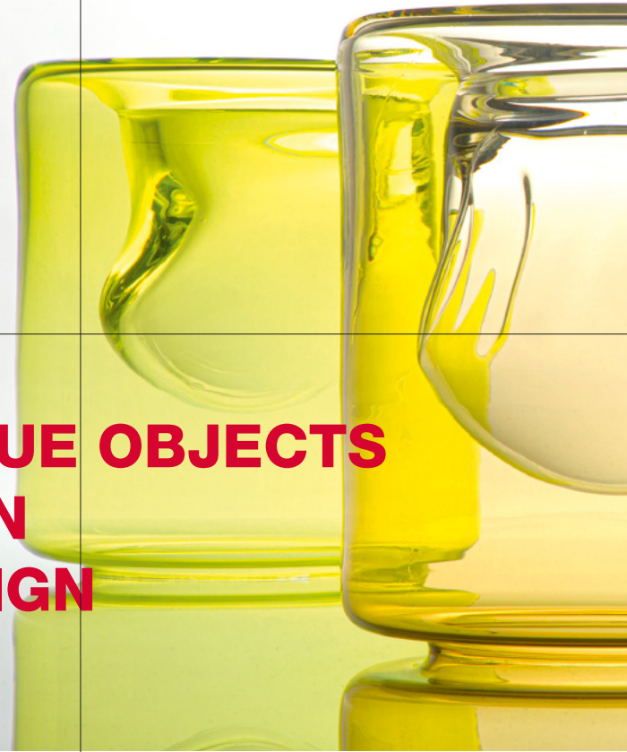
KERSTIN FROCH - MICHAEL GRANDT - LENNART EBERT

The workshops of the Faculty of Communication Design – the photography studio, the green screen studio and the printing shop – are also naturally at your disposal.