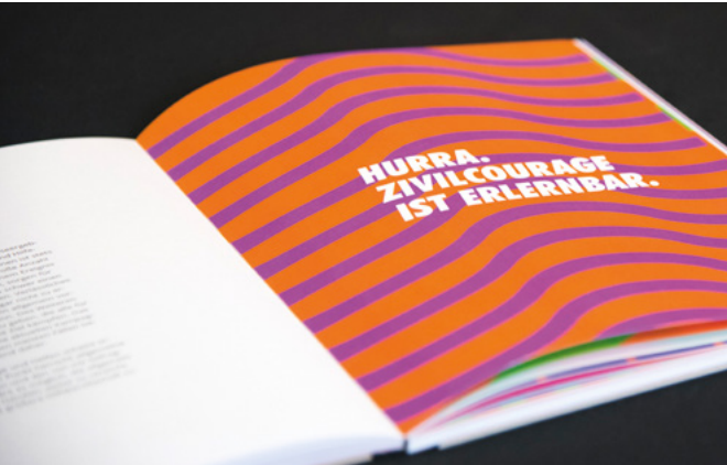
STRENGTHEN MORAL COURAGE LISA NATRUP

The curriculum is designed to give you the skills to successfully carry out your Master’s project, develop a reflective position in design and successfully put it into design practice.